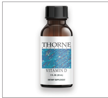
THORNE VITAMIN D CAPSULES $17