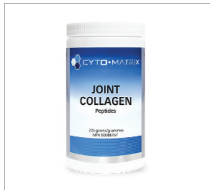
CYTO-MATRIX JOINT COLLAGEN - $40