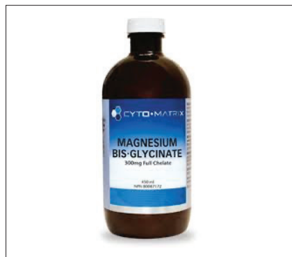
CYTO-MATRIX MAGNESIUM BIS-GLYCINATE LIQUID - $40