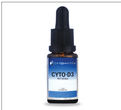
CYTO-MATRIX VITAMIN D3 DROPS 1000IU - $17