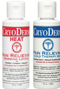
CRYODERM HEAT/COLD $22