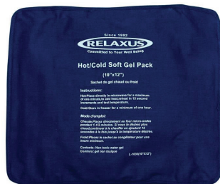
RELAXUS ICE/HEATPACK $15