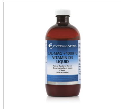
CYTO-MATRIX CAL/MAG/ VIT D3 LIQUID - $40