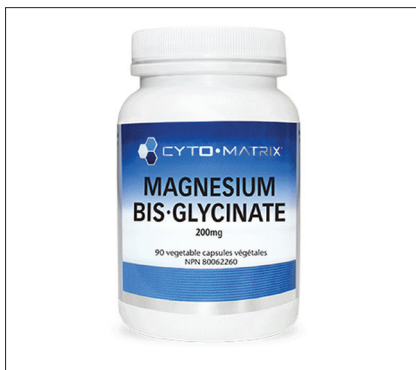
CYTO-MATRIX MAGNESIUM BIS-GLYCINATE - $35