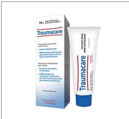
TRAUMACARE OINTMENT 50G - $24