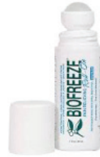
BIOFREEZE ROLL ON $22