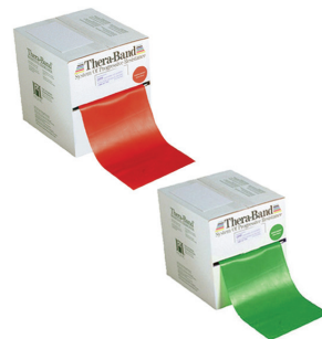
THERABAND RED/GREEN $10