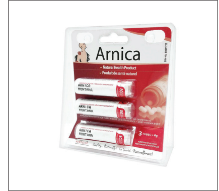
ARNICA PELLETS $20