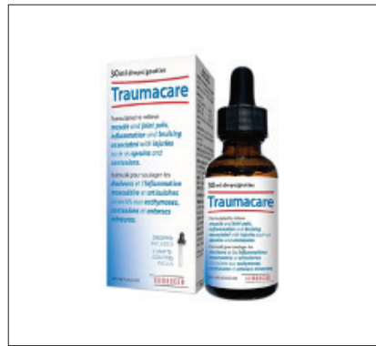
TRAUMACARE 30ml DROPS $24