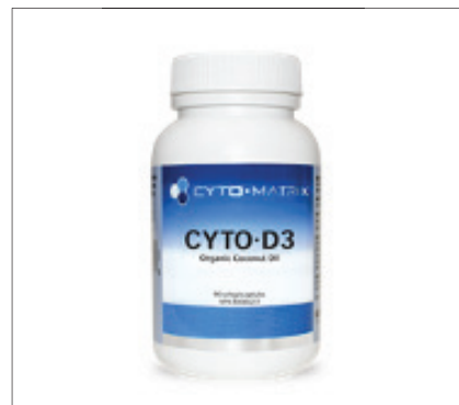
CYTO-MATRIX VITAMIN D3 CAPSULES 1000IU - $17