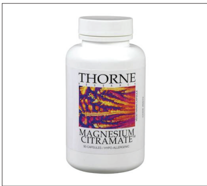
THORNE MAGNESIUM CITRAMATE - $17