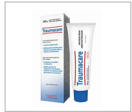
TRAUMACARE OINTMENT 100G - $44