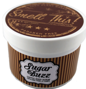
COFFEE BODY SCRUB - $18 GRAPEFRUIT BODY SCRUB - $18