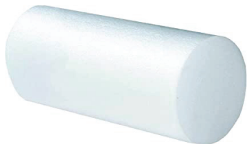
FOAM ROLLER 36" $38