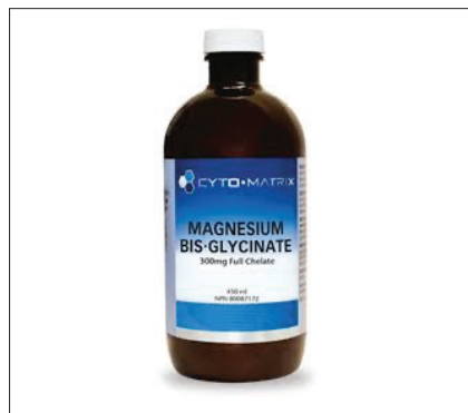
CYTO-MATRIX MAGNESIUM BIS-GLYCINATE LIQUID - $40