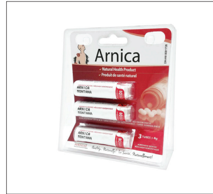
ARNICA PELLETS $20