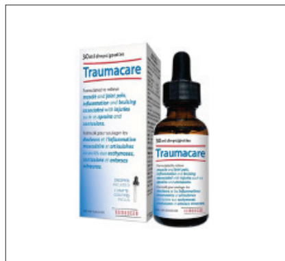
TRAUMACARE 30ml DROPS $24