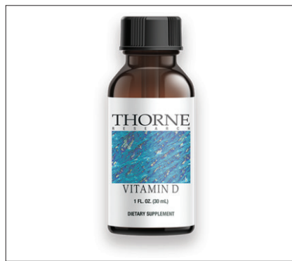
THORNE VITAMIN D CAPSULES $17