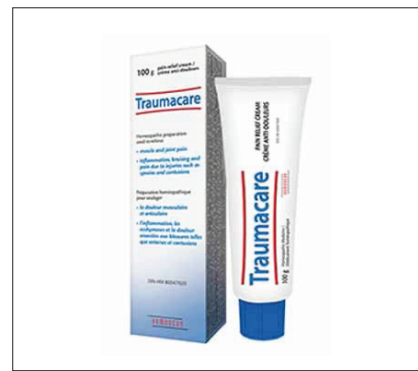
TRAUMACARE OINTMENT 100G - $44