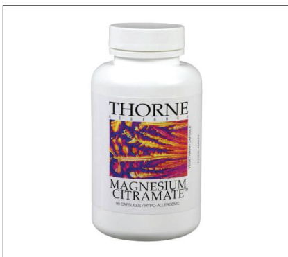
THORNE MAGNESIUM CITRAMATE - $17